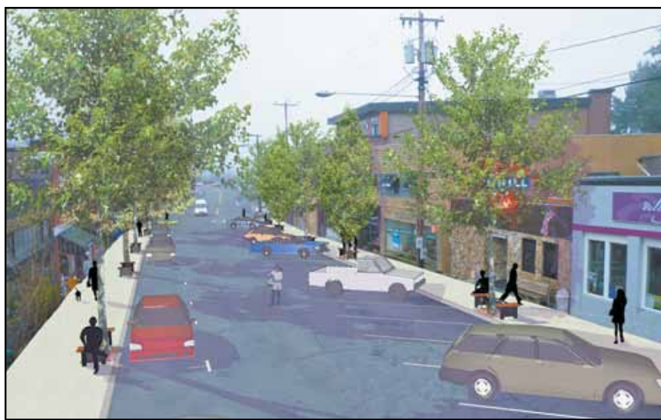
Southwest Capitol Highway at 35th Avenue, looking west.

For more information about the Multnomah Village Stormwater Project, please email ivy.dunlap@portlandoregon.gov or visit www.portlandonline.com/bes .