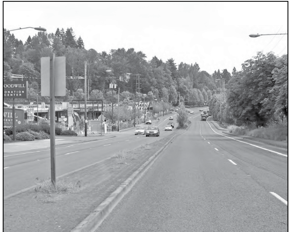
A recent view of Barbur Boulevard looking north at 13th Avenue.

The biggest problem near 13 th , the report said, is the fact that the land is largely in the hands of absentee owners seen as less likely to "reinvest." There is relatively good infrastructure, the report says, but it calls for a new traffic