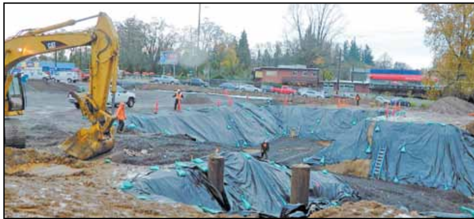
Footings are being installed for the new Safeway under construction at Barbur Boulevard and Capitol Hill Road.

"As you know, when you have the City [of Portland] involved," said