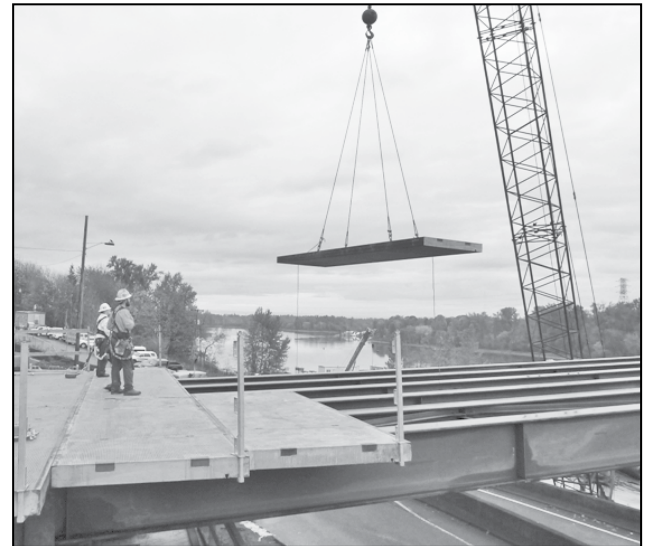
Construction continues on the Sellwood Bridge as workers add deck panels to the west approach of the detour bridge.

"The biggest traffic impact is likely to be on the east side," Pullen told The Post , but there may be heavier than