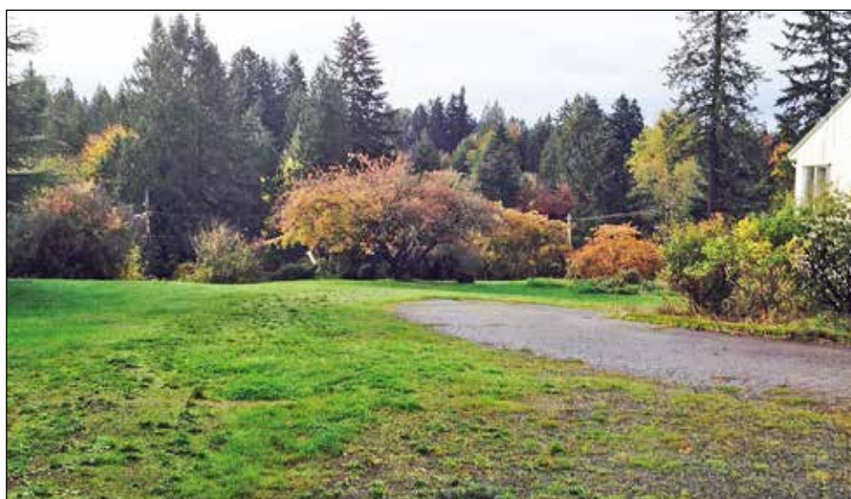
A view of the United Methodist Church property facing south. Habitat for Humanity is planning to build a cluster of affordable homes here.

This has included building communities of detached single family homes, like the 21 homes currently under construction in the Cully neighborhood.