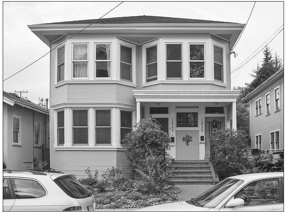
This stacked duplex is an example of the missing middle housing in Portland. An amendment to the Portland Comprehensive Plan would allow duplexes, triplexes and accessory dwelling units in single-dwelling zones. From "Missing Middle Housing" by Daniel Parolek. Photo courtesy of Opticos Design, Inc.

Not represented by the neighborhood association are younger families, renters, singles, and a more diverse population who find themselves priced out of this homogenous community.