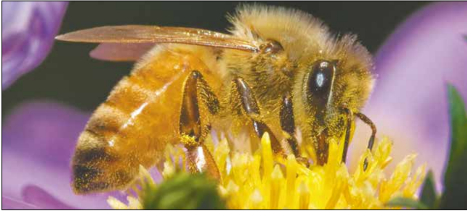
Activists would like the U.S. government to ban a class of insecticides called neonics that they blame for wiping out the bees that pollinate a majority of our food crops.