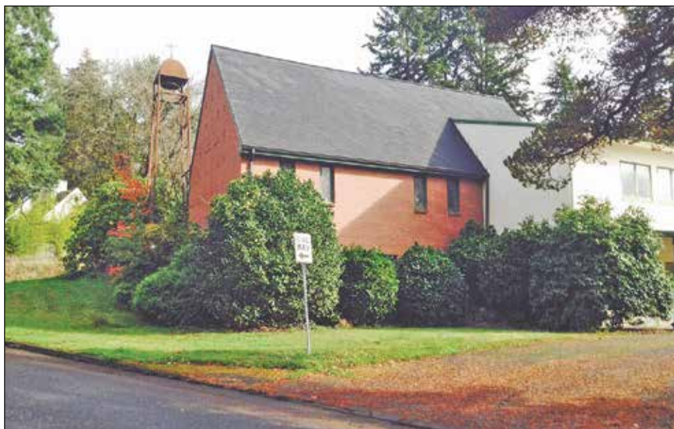
The United Methodist Church building at Southwest 24th and Taylors Ferry Road is not being used due to deterioration.