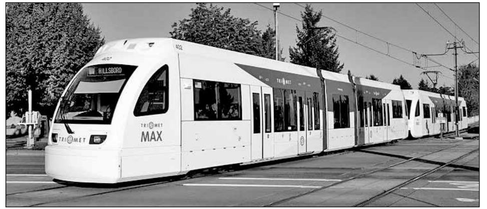
A MAX light rail train with Type 4 cars crossing 185th Avenue from Beaverton into Hillsboro.

described uncertainties of traffic lanes disappearing on Barbur Boulevard. A Metro memo of Sept. 21 said that the project will not remove any "through lanes" that are continuous on Barbur Boulevard.