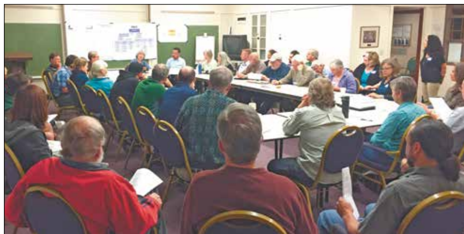
Members of three Southwest committees sit down together to meet with staff of the city bureaus of Environmental Services and Transportation.