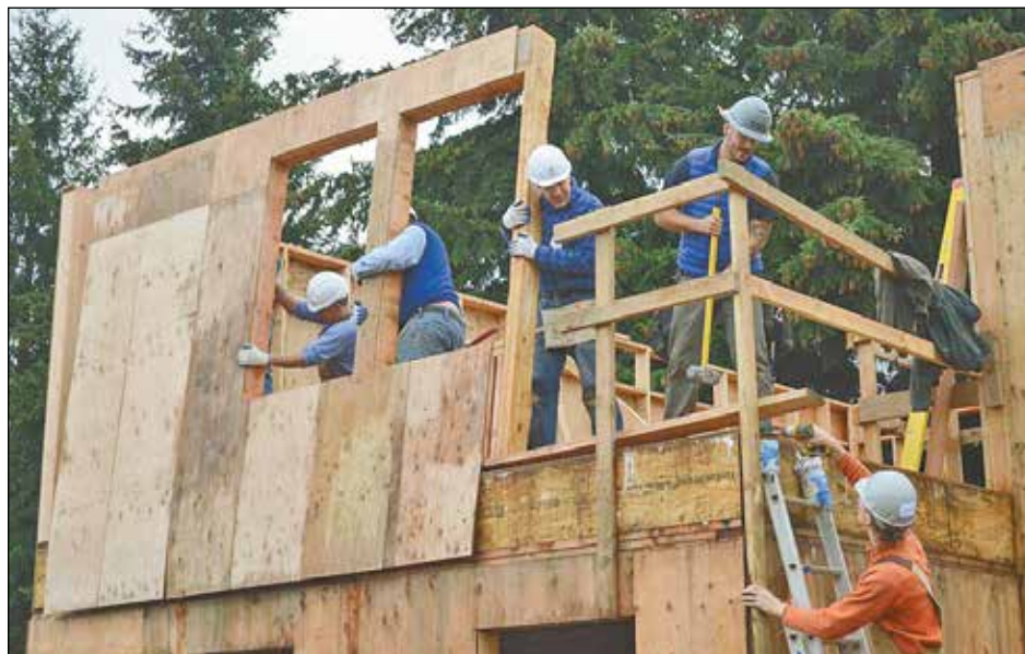
Habitat for Humanity plans to purchase property from the United Methodist Church in Southwest for a new housing development.

"With the increases in land values in recent years, this has become extremely