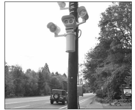
Speed safety cameras posted on Beaverton-Hillsdale Highway.

Transportation bureau staff also conducted extensive outreach with local neighborhood associations as well as more than 75 businesses and community organizations to raise awareness of the changes along the corridor, before the cameras were installed.