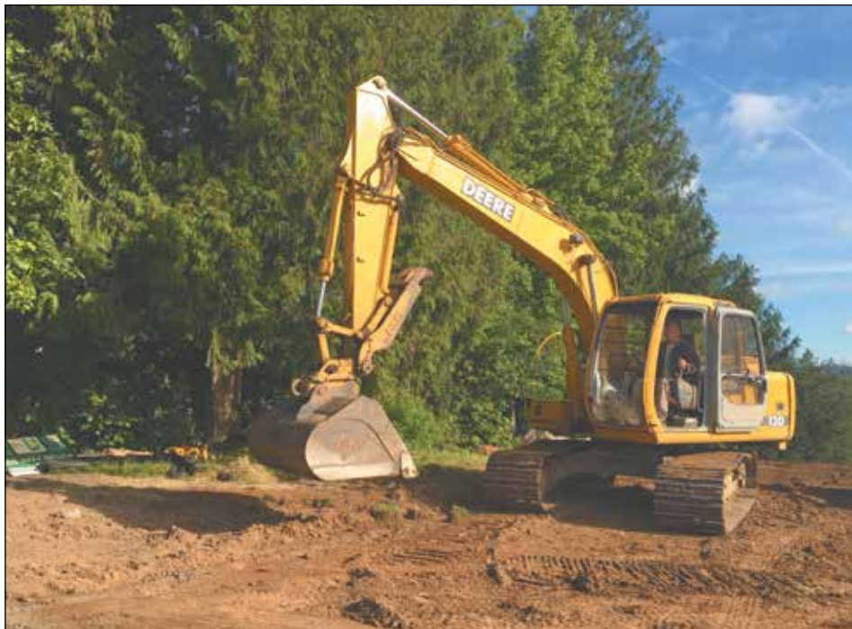
Construction began June 19 on Spring Garden Park. Paul Brothers, Inc. won the landscaping bid. The entire park is fenced off until completion.