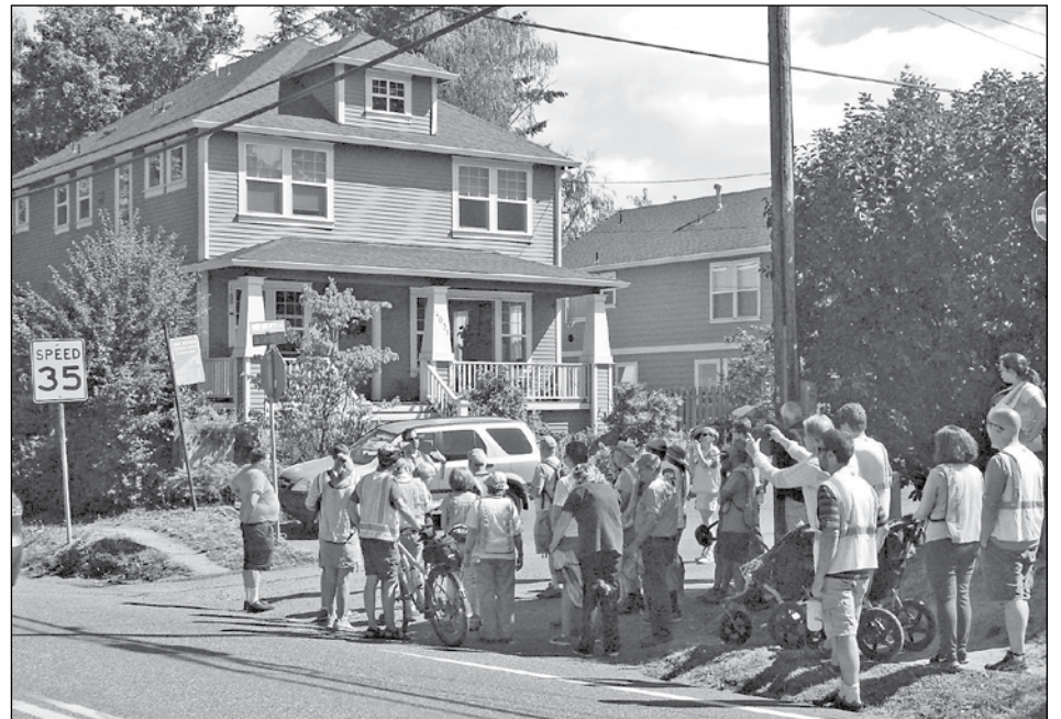
Some 40 neighbors and city staff gathered at the corner of Alice Street during a walking tour of Capitol Highway on July 30, 2016.