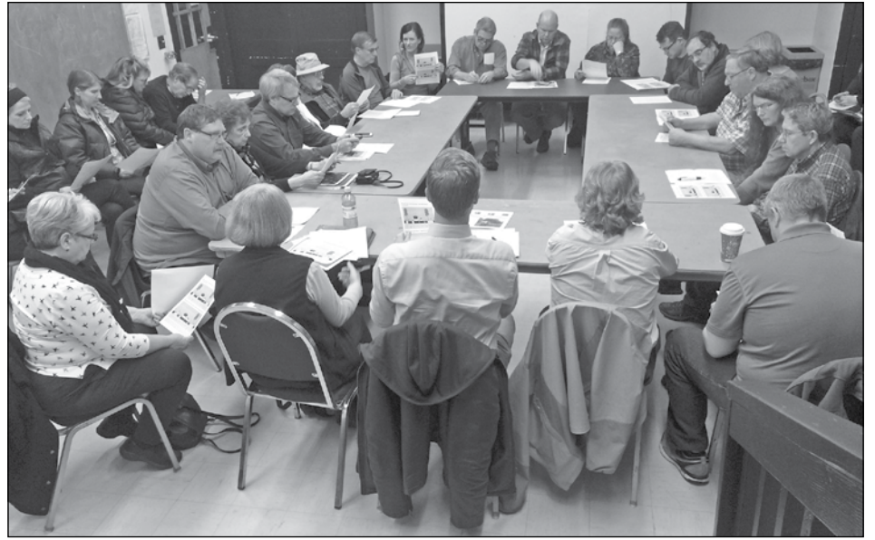
The Capitol Highway Subcommittee meets at the Multnomah Arts Center in December 2016.

"If you plan to pave with asphalt, a city permit with Public Works must be acquired," Szigethy said as he