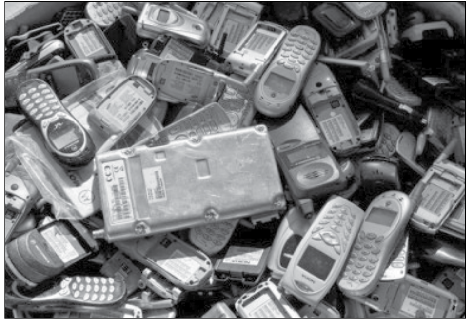
Old cell phones can leak all kinds of hazardous elements into soils around landfills and potentially contaminate nearby groundwater supplies.