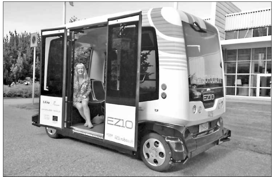
In March, an autonomous shuttle demonstration took place on the University of Texas campus in Austin, Texas.