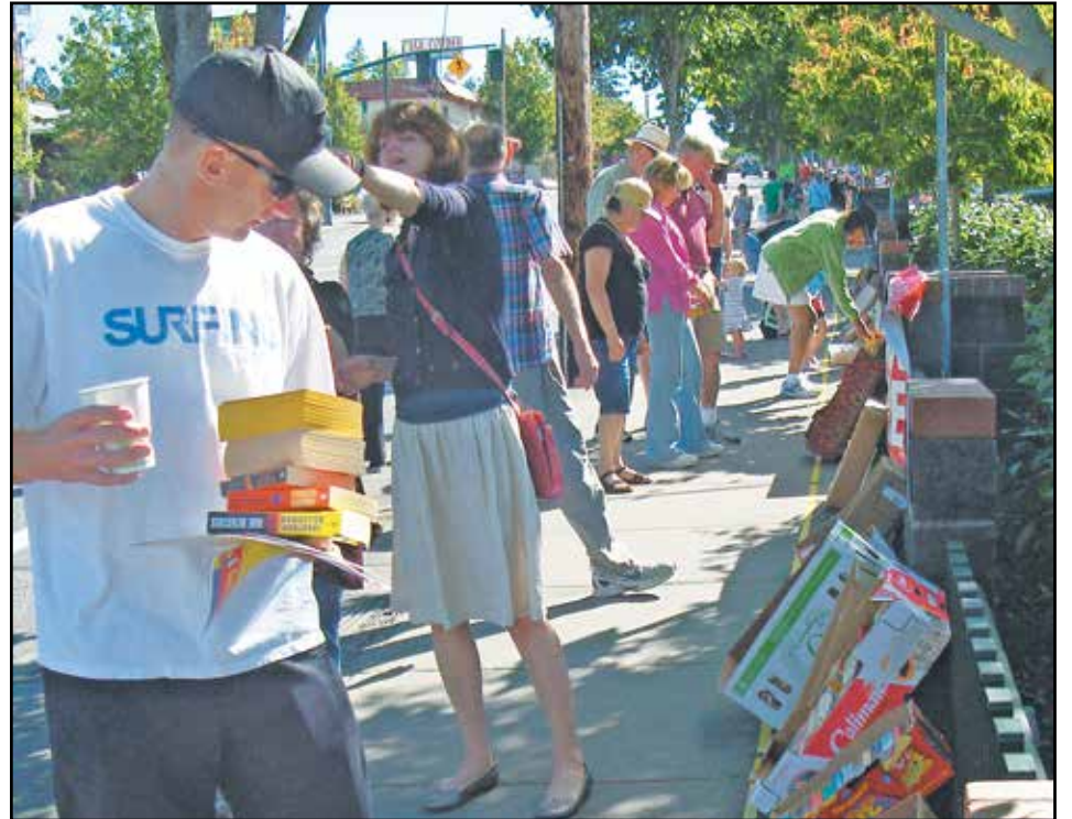
Hillsdale shoppers browse the sidewalk displays at the annual Hillsdale Book Sale.

one of the volunteer organizers of the event. "Make your donations on the two Sundays prior to the sale."