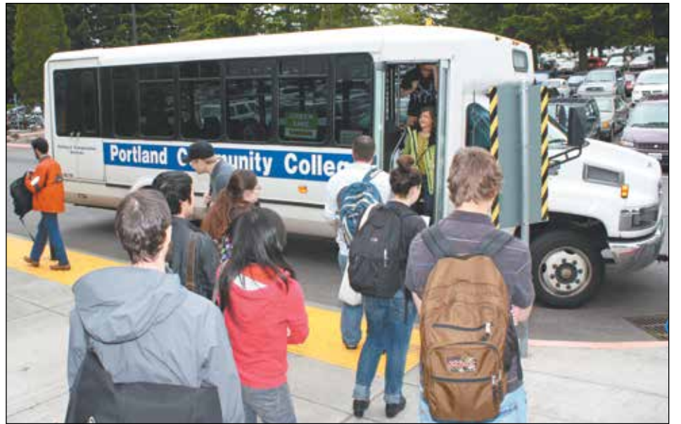
Metro is considering an autonomous (driverless) shuttle to carry passengers between light rail stations and Portland Community College Sylvania.