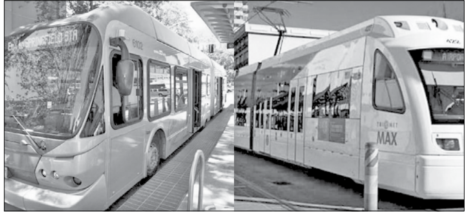
This montage shows a bus rapid transit vehicle from Eugene's EmX system (left) and a more-familiar Portland MAX light rail train.

Others commented that the project must include housing and development components, and the need for safer ways to walk and bike to transit. Growing congestion was a common theme and a need for better transit overall. The most frequently selected factors included shorter travel time, enough capacity to serve rush hour