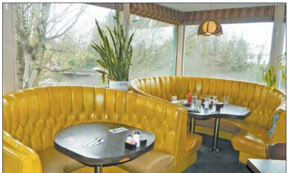
The original booths await more customers now that the Golden Touch restaurant will remain open for another year.