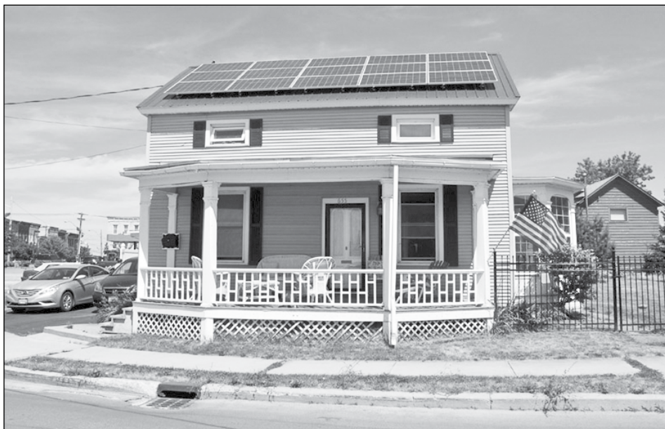
The best three states across the U.S. for putting solar panels on the roof are in the Northeast.

He adds that their efforts have “darkened green-energy prospects in could-be solar superpowers” like Arizona and Nevada. “But nowhere has the solar industry been more eclipsed than in Florida, where the utilities’ powers of obstruction are unrivaled.”