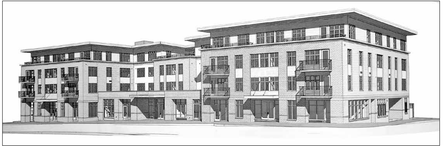
of latest architectural drawings; design by SERA architects, developer is Urban Assets Advisors.