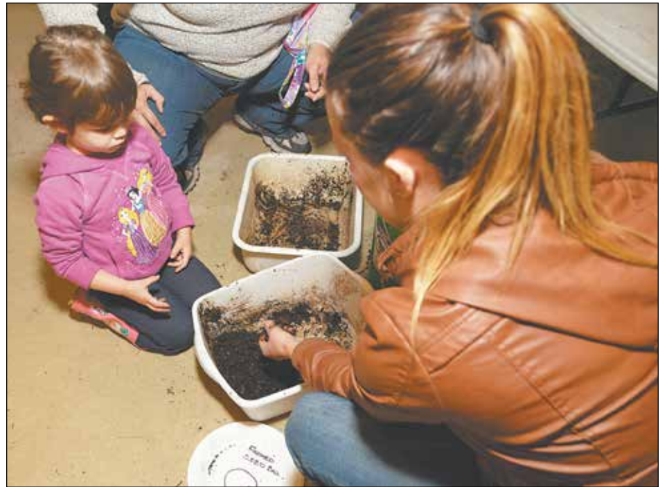
The 36th Annual Trillium Festival & Native Plant Sale is April 2-3 at Tryon Creek State Natural Area.