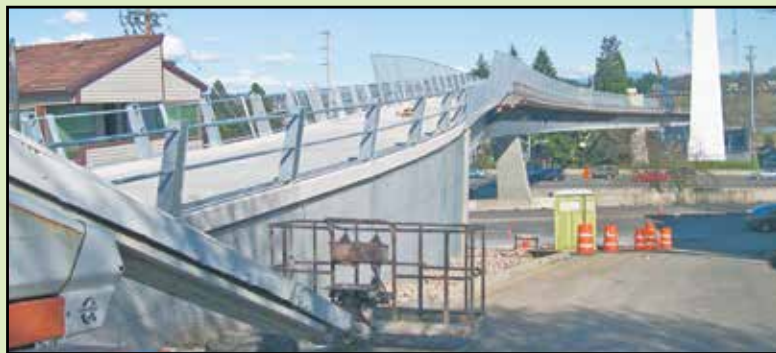
Gibbs Street pedestrian bridge.