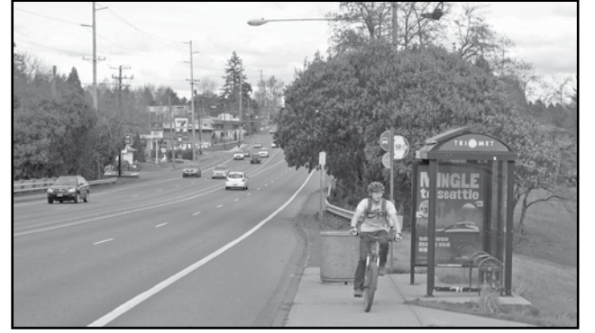
A potential light rail station, Southwest 26th Avenue is one of the focus areas of the Barbur Concept Plan.

Gibbon added that the cost of City-required storm water treatment with any development would be "really spendy." Fregonese said, "We need to make sure the person coming in for a