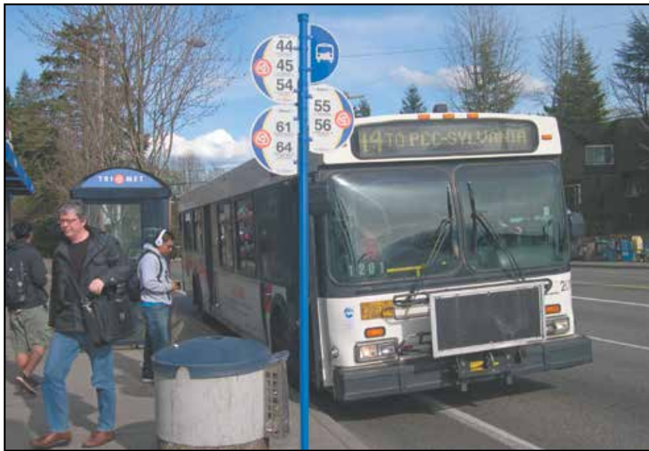
The #44 bus stops at Capitol Highway and Sunset Boulevard, March 26. According to a TriMet study this is the busiest bus stop in Hillsdale.