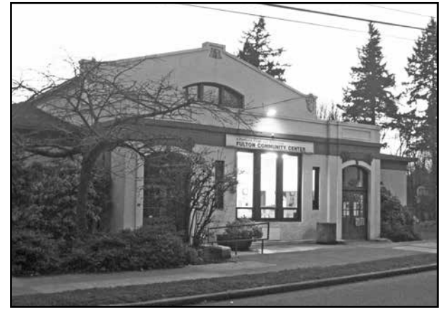
Fulton Park Community Center may be spared from proposed budget cuts by Portland Parks and Recreation.

In another poll those present were asked to prioritize their top safety concerns; the results in order were traffic safety followed closely by drug dealing, thefts from vehicles, gang activity, and burglary.