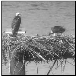
Osprey family nest on the west bank of the Willamette River at South Waterfront.

With the osprey roost issue solved, at least in concept, the Portland Design Commission approved the Portland Bureau of Parks and Recreation's South Waterfront Greenway Master Plan last month.