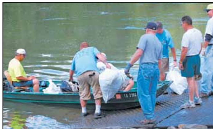
Local community volunteers clean up the Des Moines River.

Some municipal, county or state governments might be inclined to help, but getting friends and neighbors involved first is a good way to demonstrate community support. Also, local businesses,