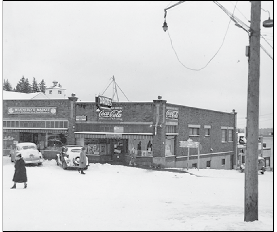
Winter scene in Multnomah, circa 1952. Weatherly's Market and Multnomah Drug Company (currently Thinker Toys).

"I do have a couple [of photos] of my mom dressed as a Native American while participating in the Chief Multnomah Days' parades, and I believe I have one of my sister and I taken in front of that third location."