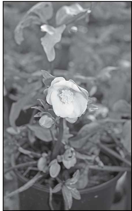
Hellborus niger 'Maestro'

Maybe your spot of green is on a patio or small yard, festooned with busy feeders for the birds. Or maybe you call all the wide beauty that Portland offers your own private landscape, and honor