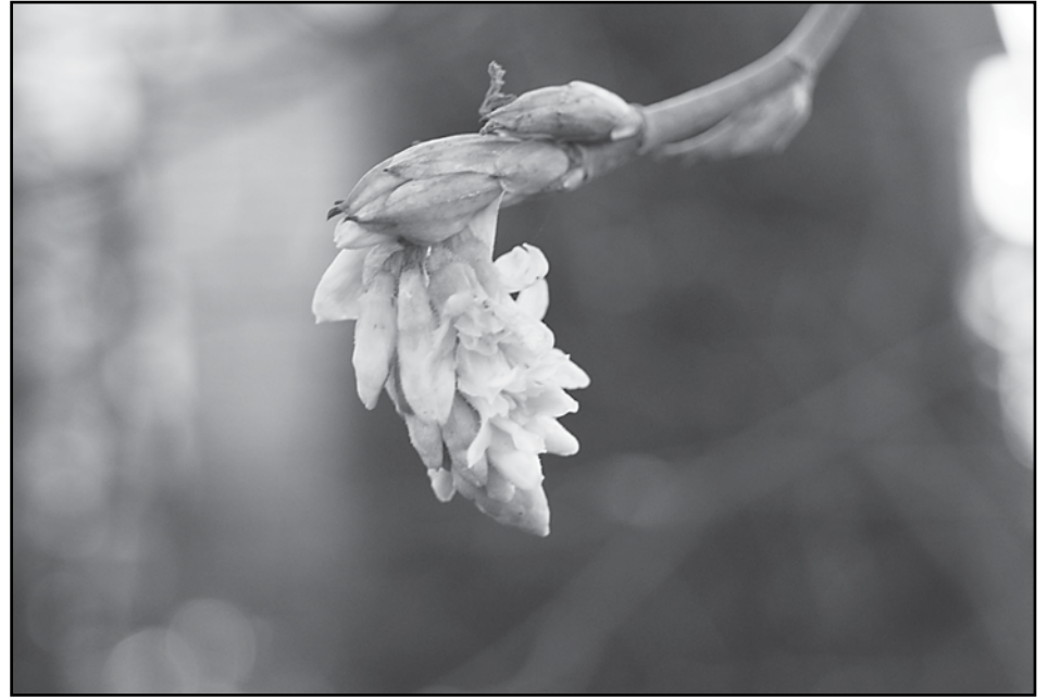
Ribes sanguineum 'Alba'

I've got three species of primroses and they all begin to show precocious color and new foliage now, if I was