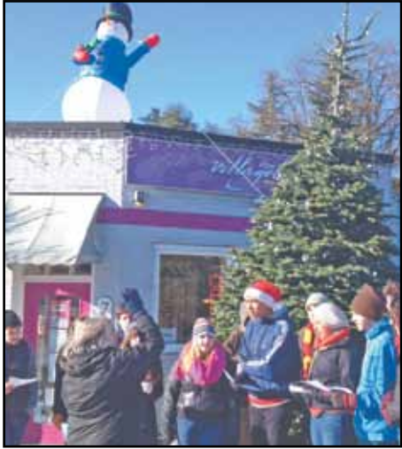
Wilson High School carolers brave the bitter cold Dec. 6 to sing in front of Village Beads and the annual Christmas tree in Multnomah Village. The tree was donated by Hager Farms.

Despite extensive construction projects in Multnomah Village throughout the year which caused confusion, park-