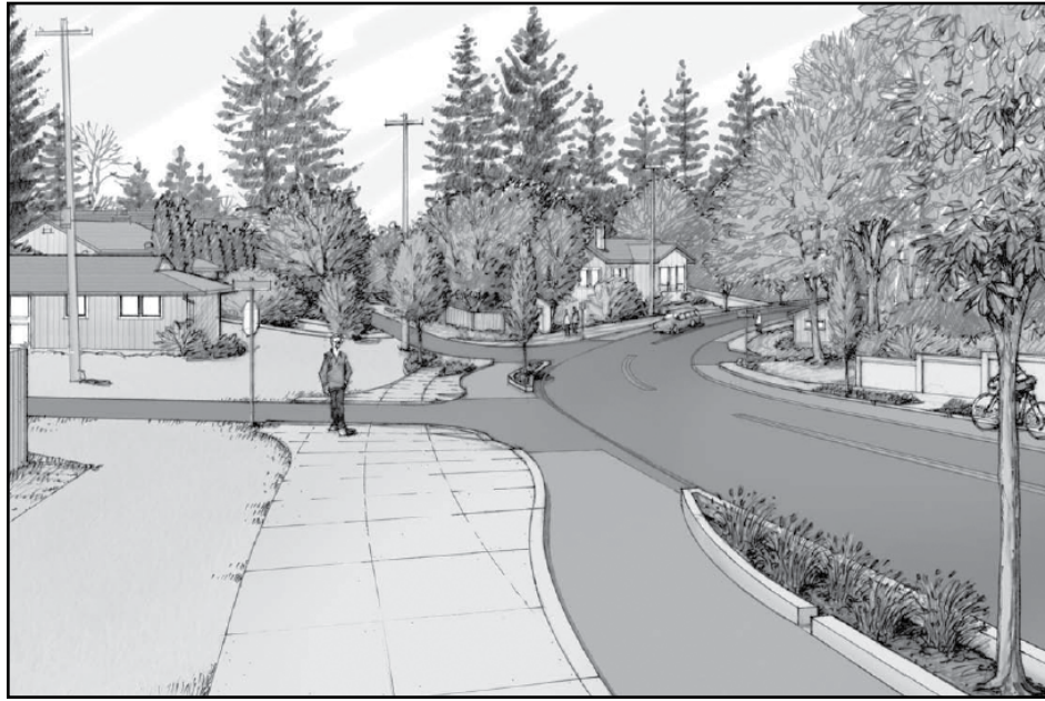
An artist's conception of Capitol Highway, complete with sidewalks, facing north toward Southwest Lobellia Street. (Graphic courtesy of Portland Bureau of Transportation)